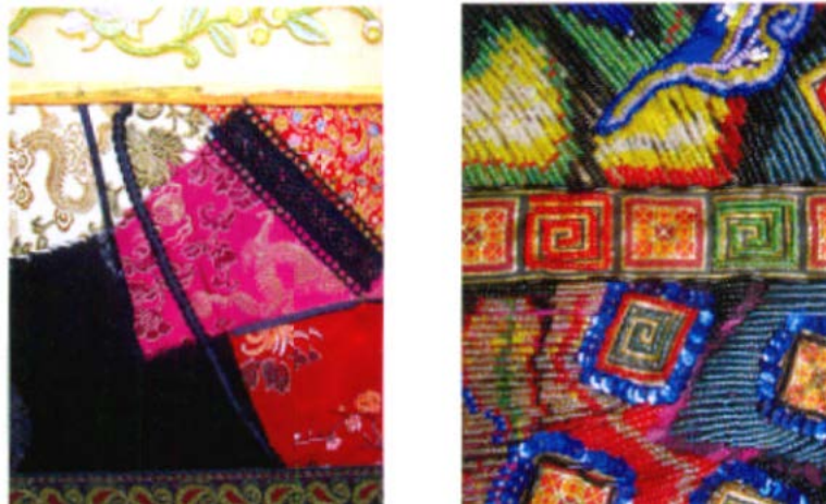
Figure 3 Practice sample of fabric reconstruction

superimposition or stacking, the texture effect of the fabric will be more obvious after folding, and the sense of style of the garment will be greatly enhanced.