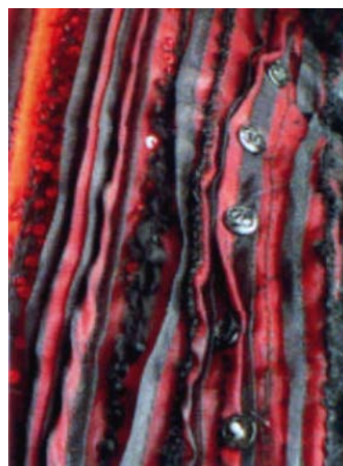
Figure 2 Fabric overlap